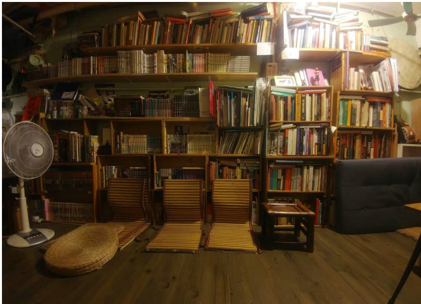
So Boring's infoshop.