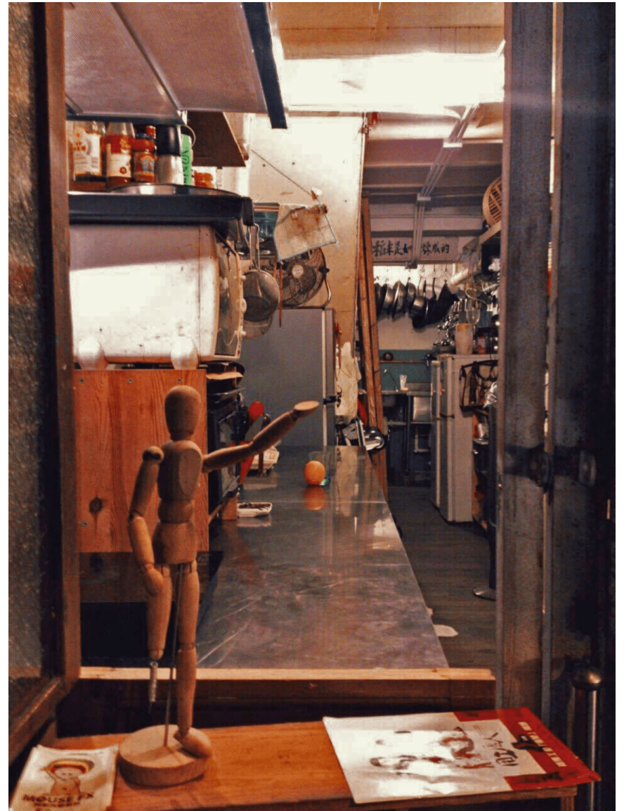
So Boring's kitchen.