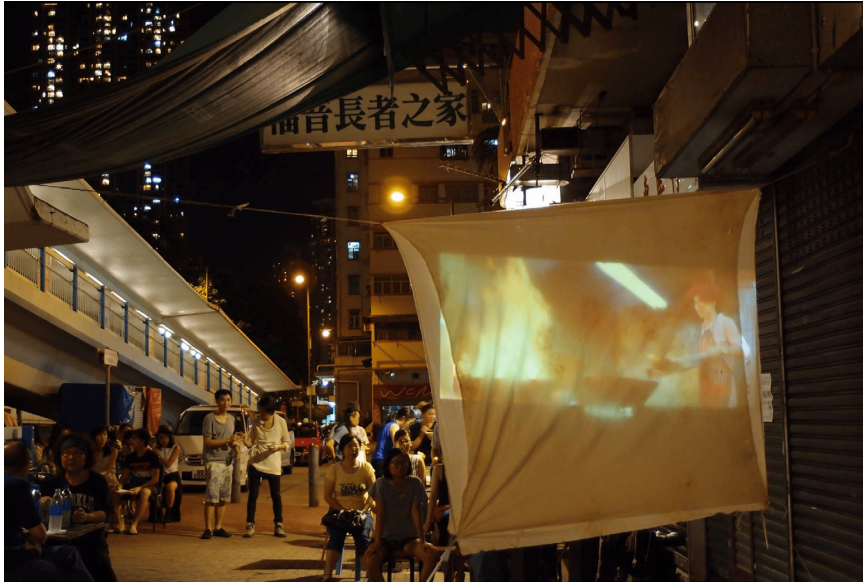
Film screening on the street outside So Boring, Black Window's former infoshop-restaurant.