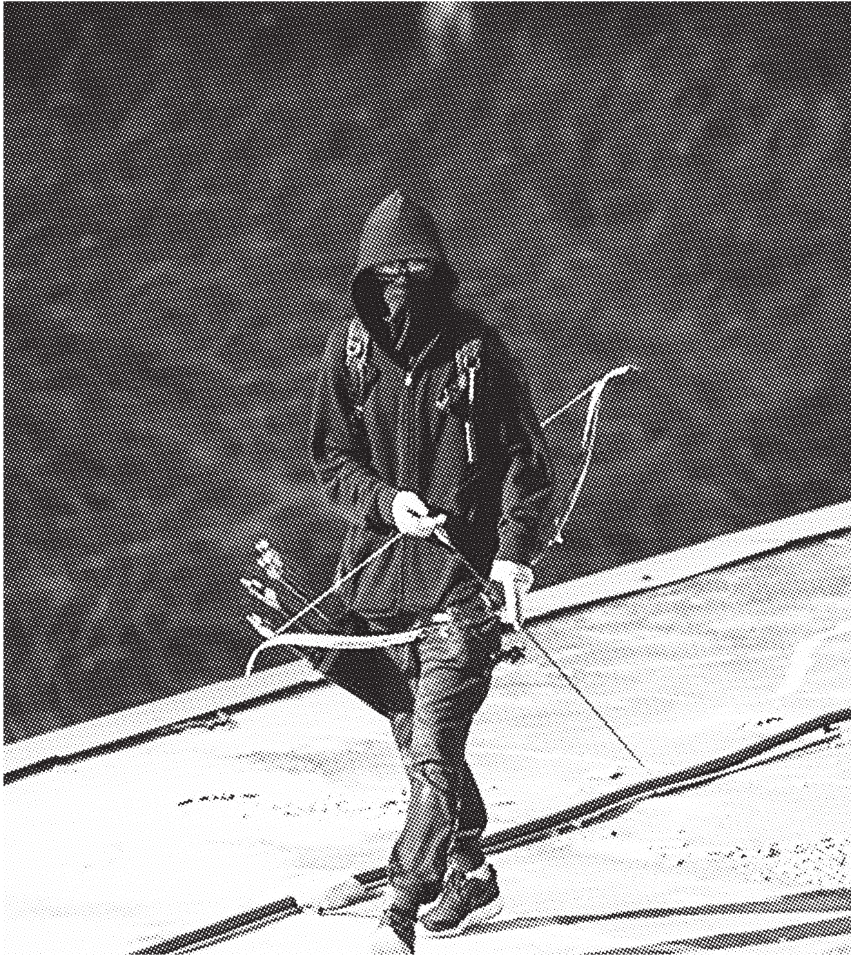
An archer on the roof of PolyU, ready to fend off a police attack by any means.

On Saturday , unarmed soldiers of China’s People’s Liberation Army cleared street barricades close to Baptist University that had been erected by protesters in the past days—the first known deployment of the Chinese army in connection with the protest movement. After a turbulent week, the situation calmed down slightly on Friday and Saturday. While protesting students gave up the occupation of Chinese University in Shatin on Friday evening, the clashes concentrated around other barricaded universities and Mongkok which has seen repeated confrontations and tear gas attacks recently. On Sunday, the police used armored cars, water cannons, teargas, and rubber bullets to attack Polytechnic University in Hung Hom, apparently the last occupied university that has been heavily barricaded and was defended