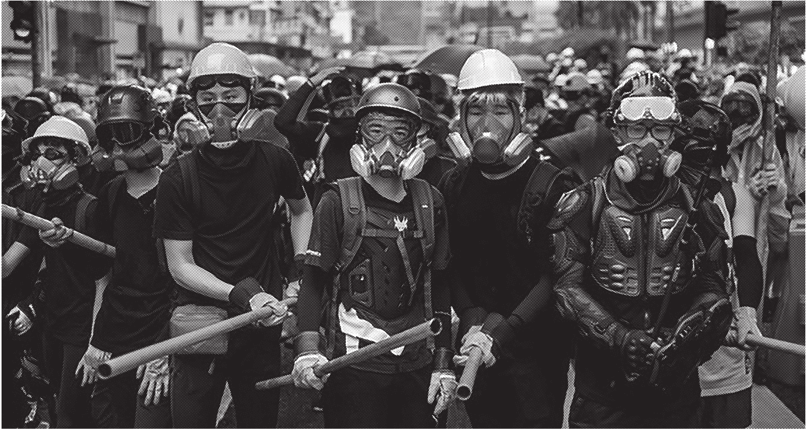
Frontline protestors don't fuck around.