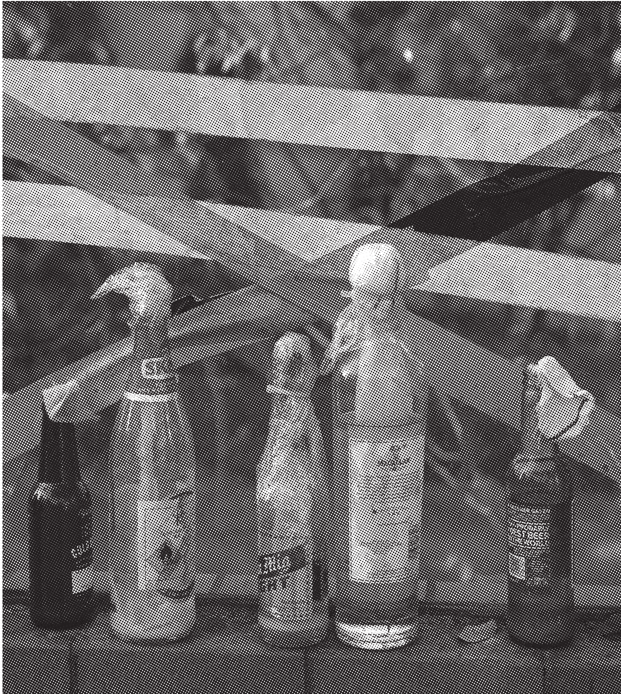
Hundreds (and possibly thousands) of Molotov cocktails, or “fire magic”, assembled and used against the police at PolyU.

Still unclear is, whether protesters in Hong Kong will see more connections with the current wave of uprisings around the globe. So far, mostly references to the Yellow Vests and the movement in Catalonia have been made.