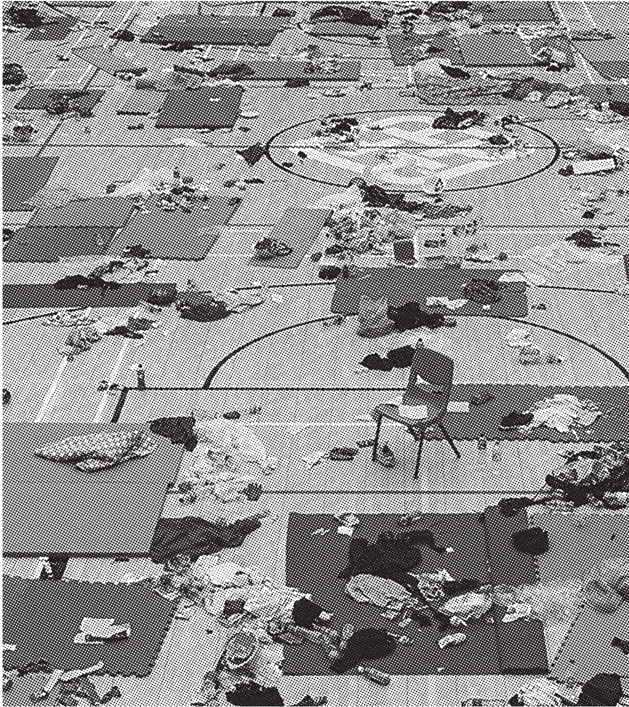
PolyU gym after most of the protesters had left.