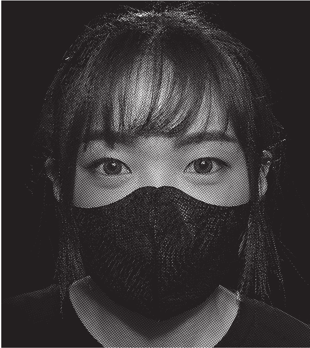
A protestor wears a mask despite a ban on masks. Thousands of others did as well.

were shouting ‘we just want to go home’ as we walked back, we weren’t even resisting. I don’t understand what kind of law enforcement this is by the police. They just wanted us dead. They just wanted to shoot and kill us.”