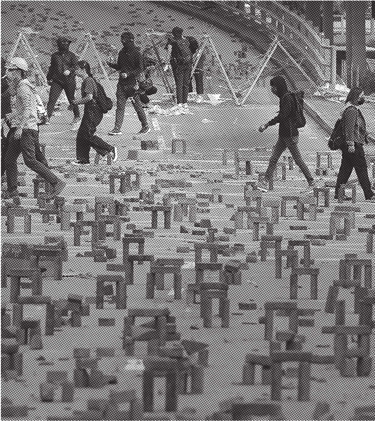
Brick structures line the streets to prevent the police and vehicles from passing.

and what's it all for? It's to defend this campus. They don't want to attack and repel the police, they just want to prevent the police from entering. These are people fighting for democracy and freedom, should they be treated this way and made to suffer?"